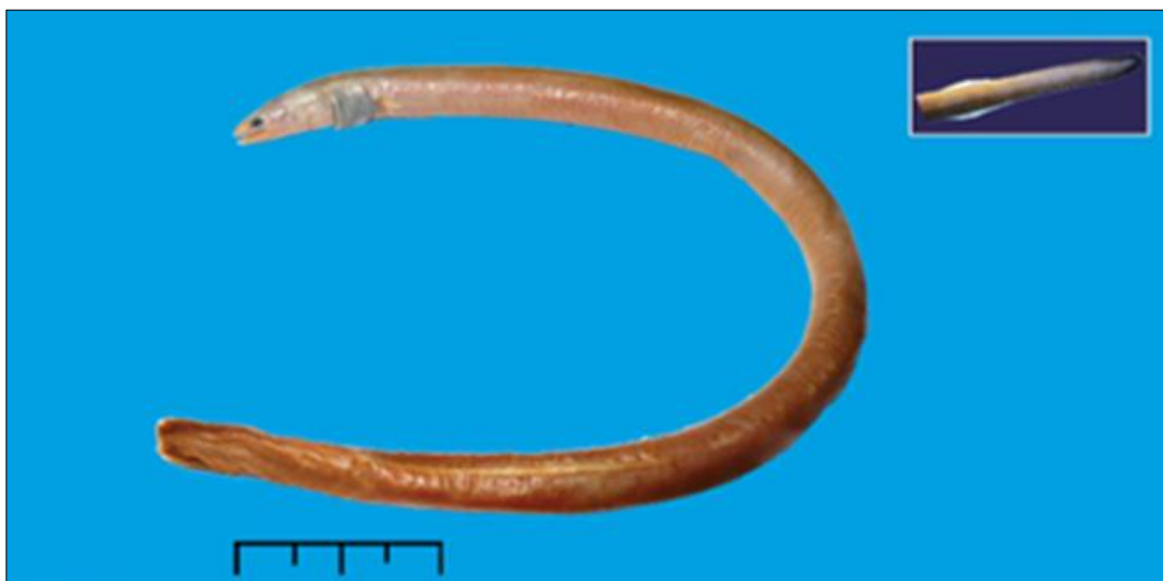
Fig 1: Moringua raitaborua (Hamilton)

Locality for both the specimens: Interu mangrove swamp of river Krishna estuarine region Andhra Pradesh.