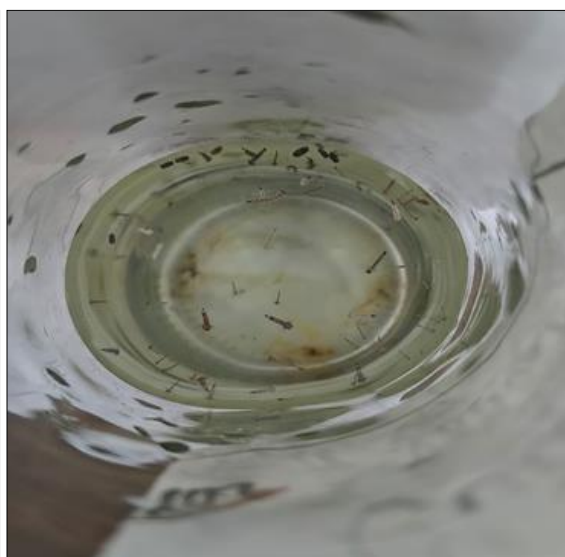
Fig 2: Culex mosquito larva