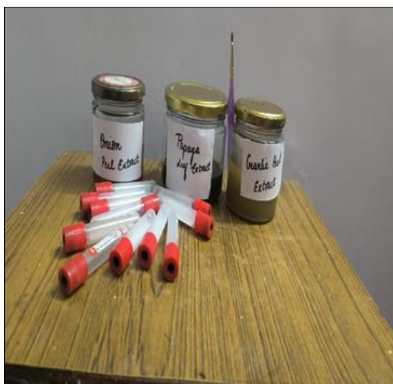
Fig 1: Material used during experiment