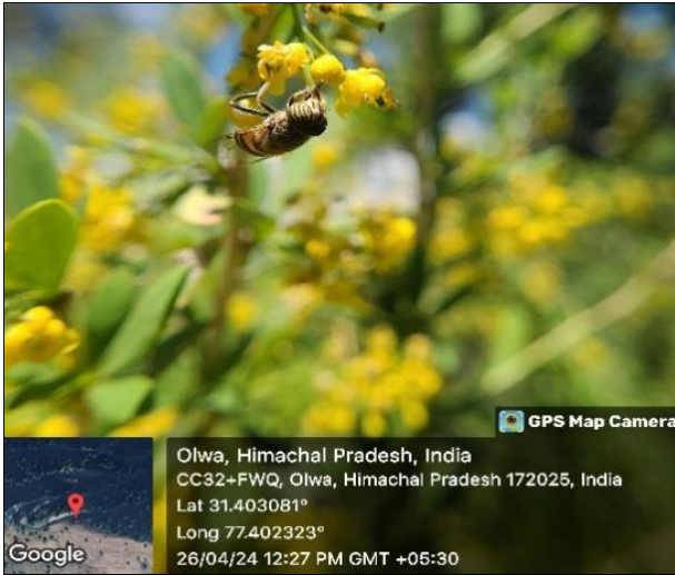
Fig 1: Adult Eristalinus paria visiting the flowers of Berberis lycium

Specimen Collection: Adult E. paria were collected from B. lycium flowers at multiple locations in Himachal Pradesh during April-May 2024 (Fig. 1). Insects were captured with the help of sweeping nets, placed in vials, and preserved, pinned and labelled for morphological examination, and stored at -80^{\circ}\text{C} for molecular analysis.