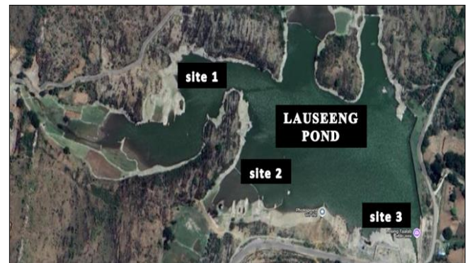
Map 1: Lauseeng Pond satellite view and selected sites

Present study was conducted in Lauseeng Pond situated 30 Km away from Udaipur district, of southern Rajasthan (Map 1). It is located in Badgaon tehsil, this waterbody is surrounded by high hills of Aravalli range. The water