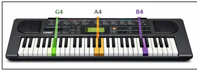
Fig 1: Sargam-Keyboard Frequency Mapping Used for Low-Frequency Acoustic Stimulation (G4-392 Hz, A4-440 Hz, B4-494 Hz).

Each frequency was applied continuously for 5 minutes. Control treatments were conducted under identical conditions without sound exposure.