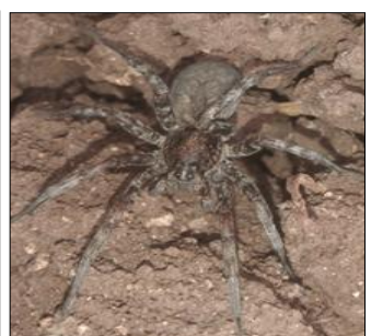
Fig 9: Hippasa greenalliae