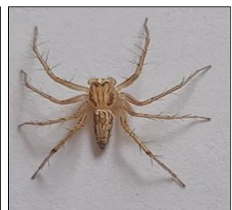
Fig 13: Oxyopes javanus