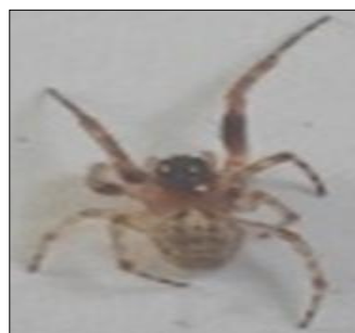
Fig 7: Hahnia mridulae