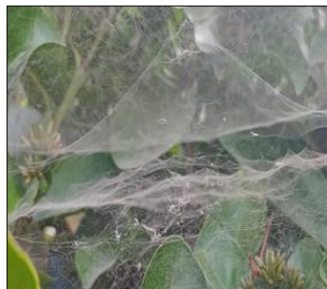
Fig 3: Cytophora cicatrosa