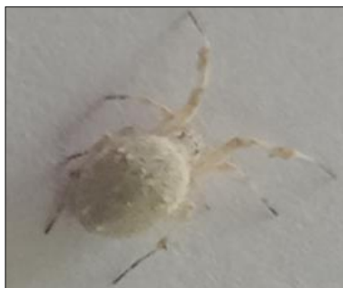
Fig 22: Theridion manjithar