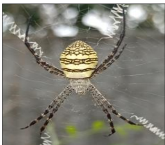
Fig 2: Argiope aemula