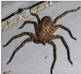
Fig 20: Heteropoda venatoria