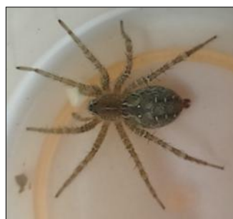
Fig 8: Hippasa agelenoides