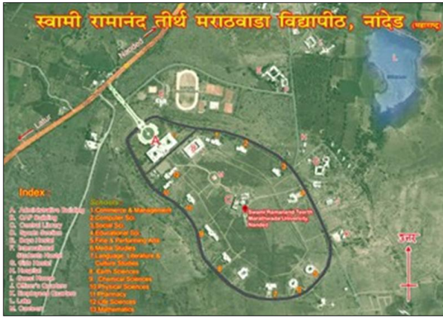
Fig 1: Study area, S.R.T.M. University, Nanded, Maharashtra (By http://srtmun.ac.in )