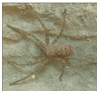
Fig 11: Pardosa pseudoannulata