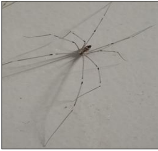
Fig 14: Artema atlanta