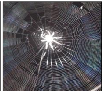
Fig 21: Tylorida striata