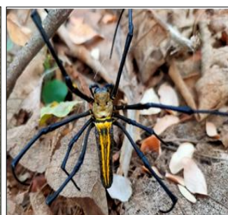
Fig 12: Nephilan pilipes