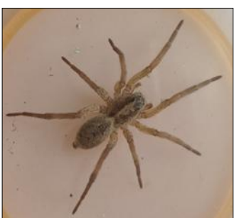
Fig 10: Lycosa tista