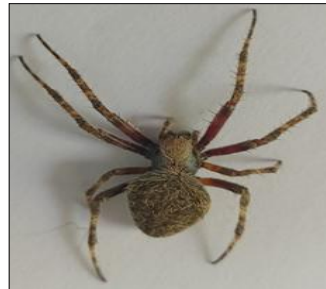
Fig 4: Neoscona bengalensis