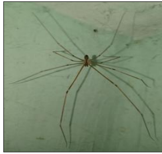
Fig 15: Pholcus phalangioides