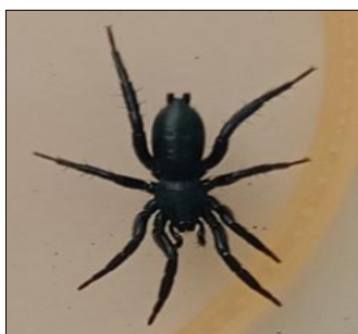
Fig 6: Scotophaeus sp.