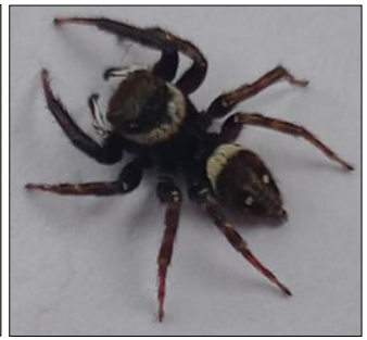
Fig 17: Hasarius adansoni