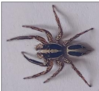
Fig 18: Plexippus paykulli