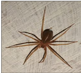
Fig 19: Loxosceles rufescens