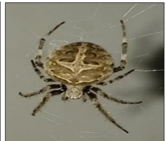
Fig 5: Neoscona nautica