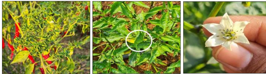
Plate 1: Symptoms of damage on flower, leaves and whole plant

Results and Discussion: The results of a roving survey conducted across eight major chilli growing districts of Karnataka namely Mysuru, Kolar, Haveri, Bellary, Raichur, Belagavi and Bagalkot during January to March 2024. A total of 64 fields of 32 villages were surveyed from sixteen taluks of eight districts are presented below. The survey aimed to assess the extent of thrips infestation and the incidence of the per cent leaf curl index (PLI).