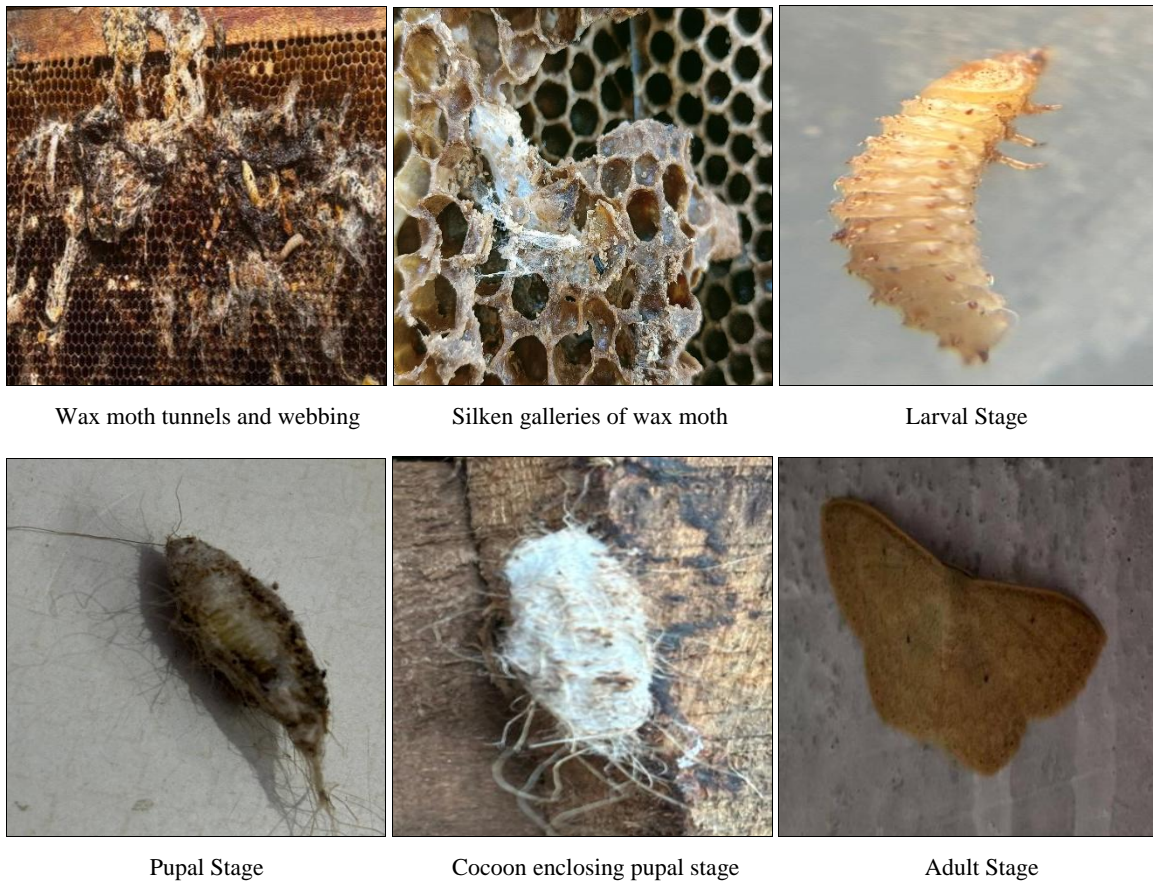
Fig 1: Wax moth stages and webs