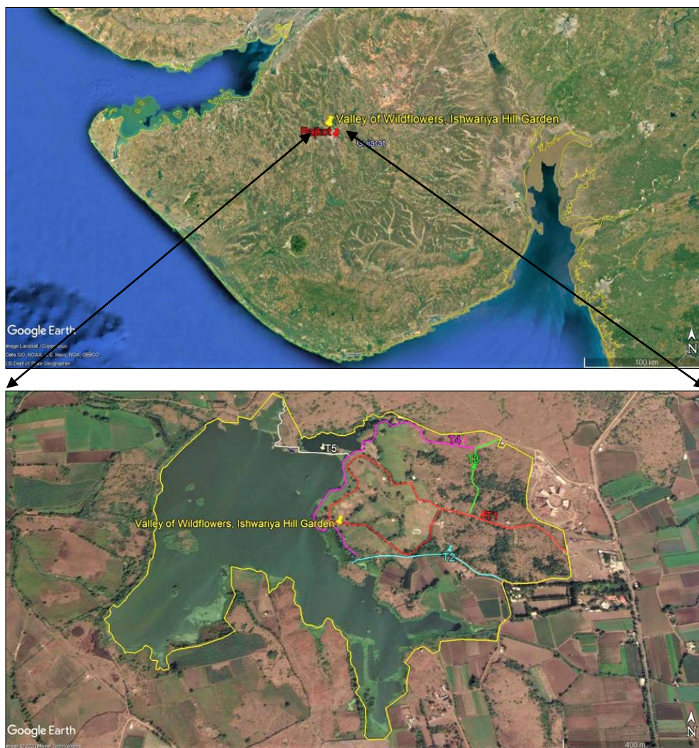
Fig 1: Illustrates the geographical position of the study site