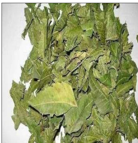
Dry Neem leaves Dry