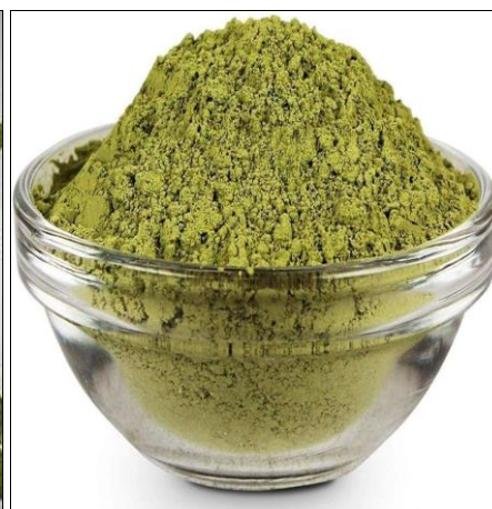
Neem leaf powder

Procedure of treatment application: During the laboratory experiments, there were three doses applied on 50 gm rice grain consisting different stages of insect, 5gm, 10gm and