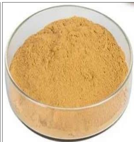
Papaya leaves powder