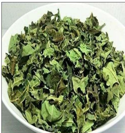
Dry Papaya leaves Dry

Fresh leaves of Carica papaya and Azadirachta indica were collected from the different local areas. After carefully washing with distilled water, fresh plant materials were dried on blotting paper. Every plant material that was shed was dried at room temperature, or 25°C. A grinder was used to powder the plant materials.