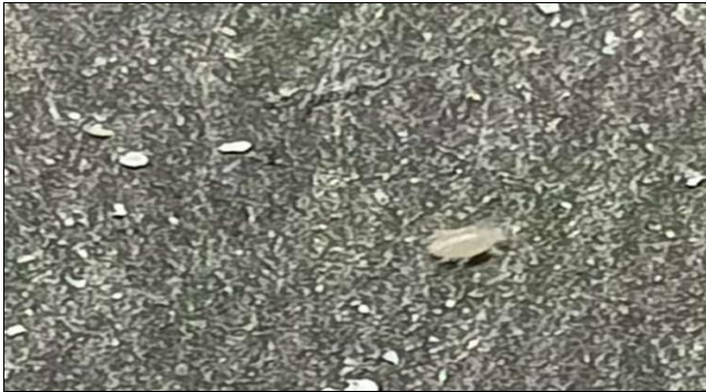
Fig 1: Larva of Sitophilus oryza

Rearing of insect: An infected rice store bin provided the original supply of S. oryzae . Insects were mass-produced in a climatized room with alternate light ± dark cycles lasting 12 hours, at 28°C, using 95% maize seeds and 5% brewer's yeast at 65% relative humidity.