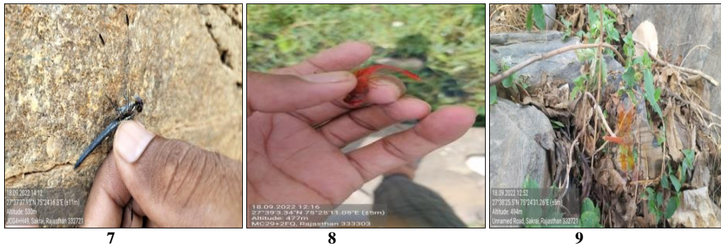
Plate 4: Fig 1. Sympetrum striolatum Fig 2. Acisoma variegatum Fig 3. Erthemis simplicicolis Fig 4. Crocothemis servilia Fig 5. Ictinogomphus rapax Fig 6. Orthetrum glaucum Fig 7. Orthetrum taeniolatum Fig 8. Aethriamanta brevipennis Fig 9. Libellula saturata