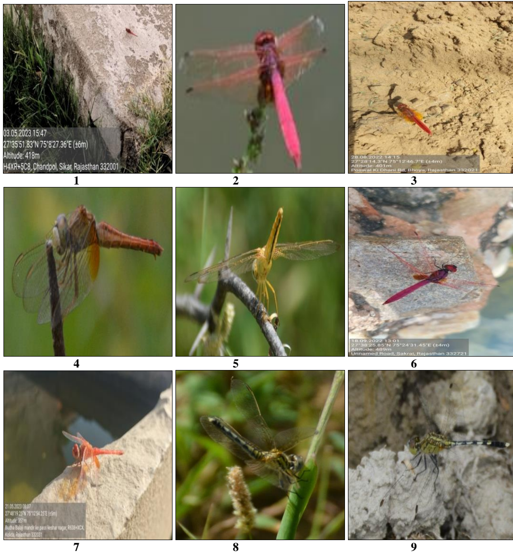
Plate 3: Dragonfly species Fig 1. Rhodothemis rufa Fig 2. Trithemis aurora Fig 3. Urothemis signata Fig 4. Crocothemis erythraea Fig 5. Tholymis tillarga Fig 6. Trithemis annulata Fig 7. Neurothemis intermedia Fig 8. Cordulegaster boltonii Fig 9. Diplacodes trivialis