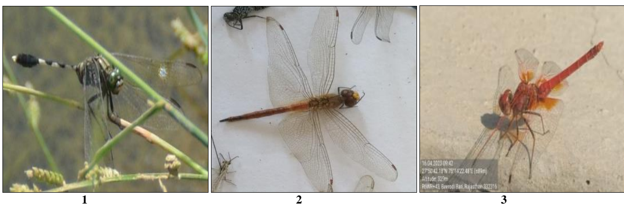
Plate 2: Fig 1. Orthetrum sabina Fig 2. Pantala flavescens Fig 3. Trithemis kirbyi

usually arrive with the first rain-making monsoon. Trithemis kirbyi is observed in the marshes, ponds, and lakes, and prefers to perch on exposed rocks, stones, dry areas, and boulders in khel and bawaris. This species favours open, arid and semi-arid landscapes, where it is found on a bare, stony or cemented plaster bottom and banks with little or no vegetation. These water bodies often dry out partially in summer. It is only present in hot areas even if the temperature is at 40 degrees celsius and is confined to low elevations (Plate 2).