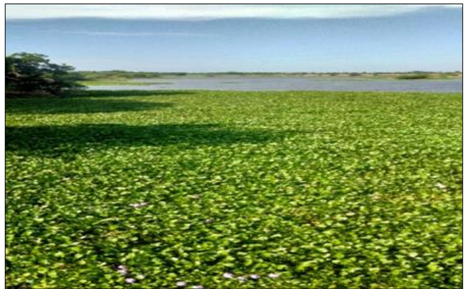
Water Hyacinth Plant