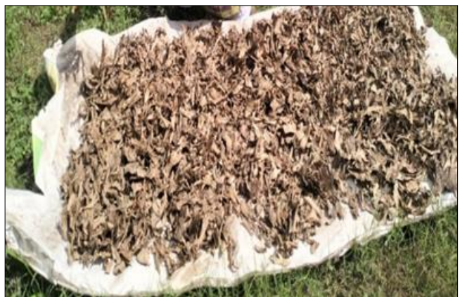
Water Hyacinth Leaf Waste