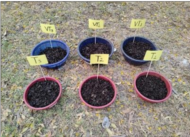
Treatment T 1 -T 3 , VT 1 -VT 3