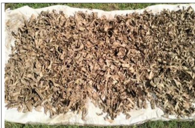
Banana Leaf Waste