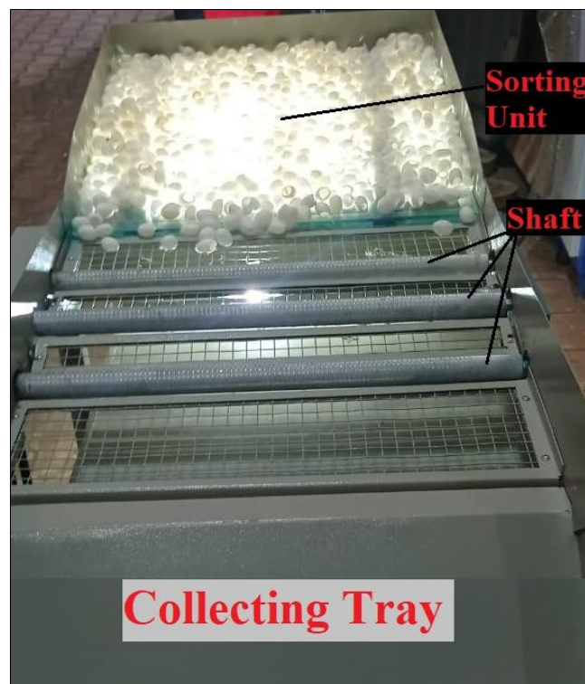
Fig 1: Front View of Cocoon Sorting and Deflossing Machine.

Discharging Plate: Directs cleaned cocoons to the outlet for further processing.