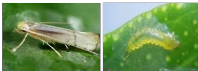
Citrus Leaf Miner (CLM) P. citrella

yield, it is essential to control this serious pest and overcome its damage. Because of toxicological problems and environmental and health hazards of chemical control in addition to high costs (Vianna et al. , 2009) [13], there is a need for developing alternative methods. Induce or strengthening the plant defense is one of these methods. Salicylic acid, is a vital component of the plant responsible for pathogen and disease resistance (Maleck and Dietrich, 1999) [8]. Key roles are played by salicylic acid and jasmonic acid in regulating plant defenses against the herbivore (Peng et al. , 2004) [9]. Therefore this study was done to clarify under field condition efficiency of the foliar applications of salicylic acid on the infestation of (CLM) in three types of citrus trees: lemon (adalia) summer orange and mandarin (morkite).