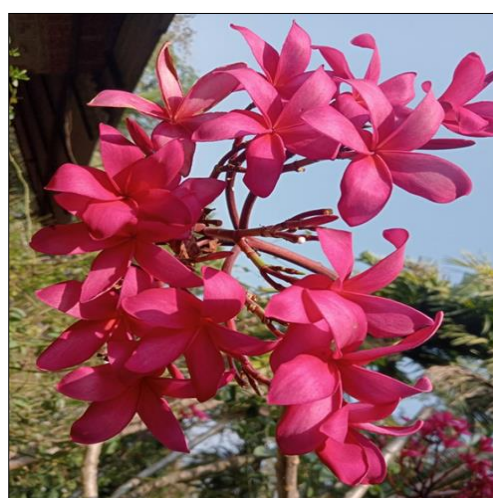
Fig 4: Flowers of Plumeria rubra L.