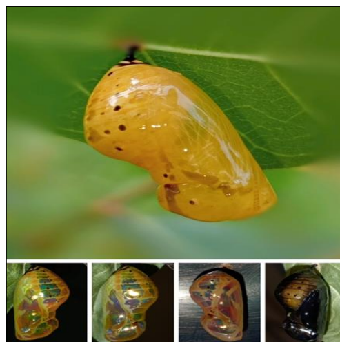
Fig 2: Pupa