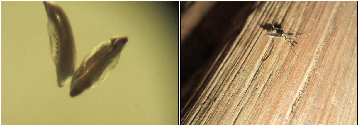
Fig A-F: A- Culex quinquefasciatus ; B- Armigere subabalbatus ; C- Anopheles stephensi ; D-Eggs of Aedes aegypti ; E- Eggs of Anopheles species; F- Armigere abturbans .