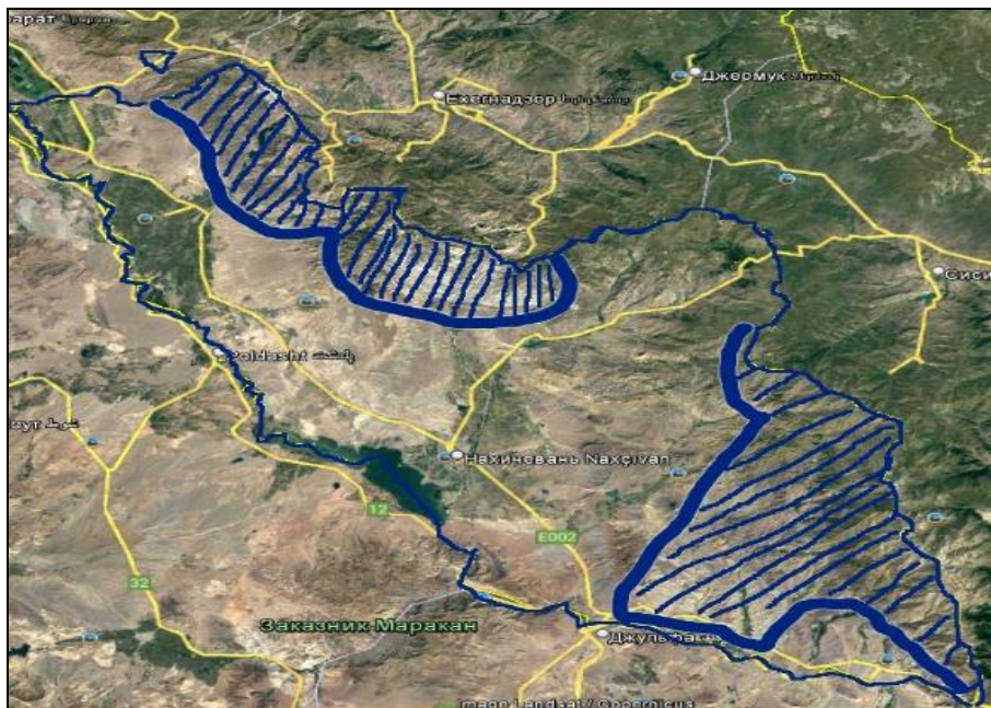
Fig 1: Female mouflon and its distribution area in the autonomous republic

Looking at the table, we see that the largest number of mouflons was in 2023 (579 individuals). The lowest number of animals by year was in 2021 (400 heads) (table).