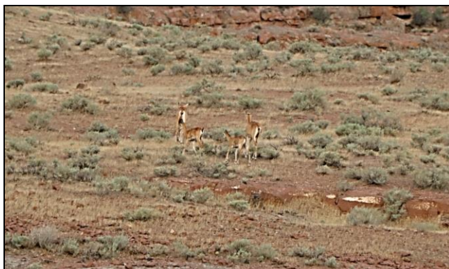
Pict 2: Mouflons with their labs

Although the number of female sheep was the least in 2019, the highest percentage of lambs was this year (113:96; 92.5%). Despite the highest number of females in 2023 (196:165 head) and 2020 (186:133 head), the percentage of cubs was at the lowest level (2020, 71%; 2016, 84%).