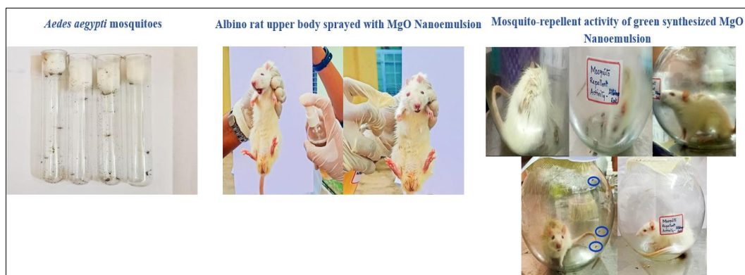
Fig 5: Mosquito repellent efficacy of Magnesium Oxide Nanoemulsion