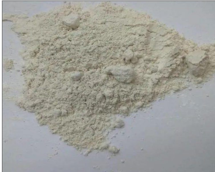
Fig 2: Biogenic synthesis of Magnesium Oxide nanoparticles from aqueous extract of Sargassum wightii