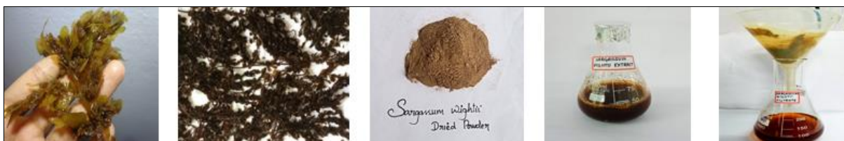
Fig 1: Preparation of aqueous extract of Sargassum wightii

Fresh Sargassum wightii seaweed was meticulously cleansed with running water to eliminate surface impurities and was subsequently rinsed with deionized water. The cleaned seaweed was then shade-dried at room temperature. Once dried, the seaweed was ground into a fine powder. A 15-gram portion of this dried powder was mixed with 250 ml of distilled water in a 500 ml conical flask to obtain the aqueous extract (refer to Figure.1)