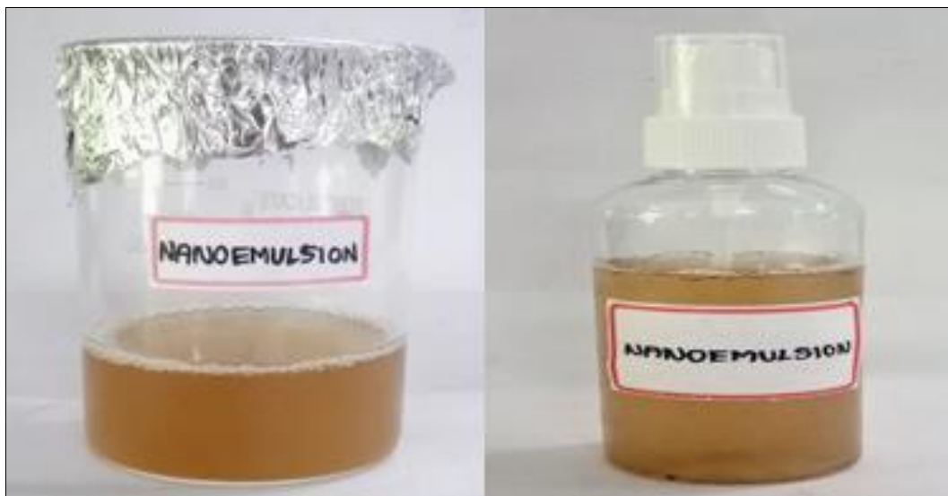
Fig 3: Biogenic preparation of Magnesium Oxide Nanoemulsion

The biogenic approach for nanoemulsion preparation using MgO nanoparticles synthesized from Sargassum wightii aqueous extract is depicted in Figure 3. The nanoemulsion, containing Tween 80 as a non-ionic surfactant, was ultrasonicated, and the resultant nanoemulsion was utilized in further experimental studies.