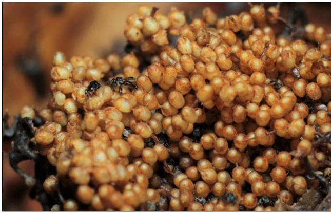
Fig 2: Internal view of nest with stingless bees