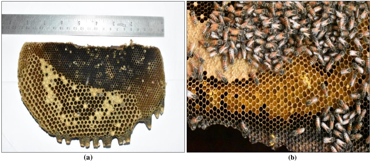
Fig 2: a) Measurement of a hive of Apis florea ; b) Pollen stored in hive of Apis florea

Ruttner (1985) [12] reported that the most outstanding traits of A. florea is to survive in very hot and dry climatic condition. Whitecombe (1984) mentioned that A. florea build their nest between 2 m and 7 m (mean=3.28 m) from the ground level in Oman. Mossadegh (1990) [9] noted that A. florea construct their colonies between 0.3 m to 14 m from the ground level in Thailand. Khan et al. (2002) [6] observed maximum number of colonies from 2m to 3m above the ground in Hissar and nests were found upto 5m height from ground. Kshirsagar et al. (1983) [7] also studied in Hissar on the nest of same species and mentioned those nests were found between 2 m to 10 m height from the ground. Narayanaswamy and Basavarajappa (2013) [10] reported that Apis florea didn't prefer to build their nest in higher elevations which support the present observation. They also reported that supportive branches used by Apis florea colonies were thin to medium sized (1 to 4 in diameter).