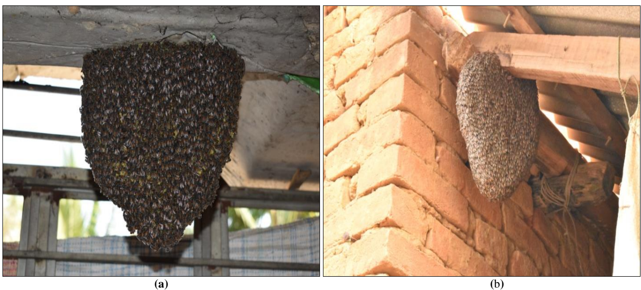
Fig 3: a) Hie of Apis florea hanging from balcony; b) Hive of Apis florea hanging from carnish

Khan et al. , (2002) [6] and Malathi (2005) [8] noted that A. florea build their nest in all directions. 4 directions of orientation of A. florea colonies (NS, EW, NE-SW, NW-SE) was reported by Shwetha et al. (2020) [15] in Mysore. Narayanaswamy and Basavarajappa (2013) [10] reported that NE-SW orientation of nest were dominant than other. The honey storage area above the supportive substrate is known as 'crown' of hive. Worker bees use it as dancing floor where they perform different communicative performance (Dyer, 1985; Wongsiri, 2006, Abrol, 2020) [2]. Queen cells are also found in the centre of the comb by the modification of worker cells for emergency purpose (Kshirsagar et al. , 1983) [7]. Akratanakul (1977) [1] observed 22 colonies and found 3 to 13 queen cells per colony which is also corroborated by the present study. Ghatge (1949) [4] have also reported 15 to 20 queen cells per colony.