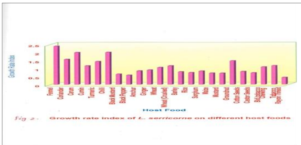
Fig 2: Growth Rate Index of L. serricorne on different host foods