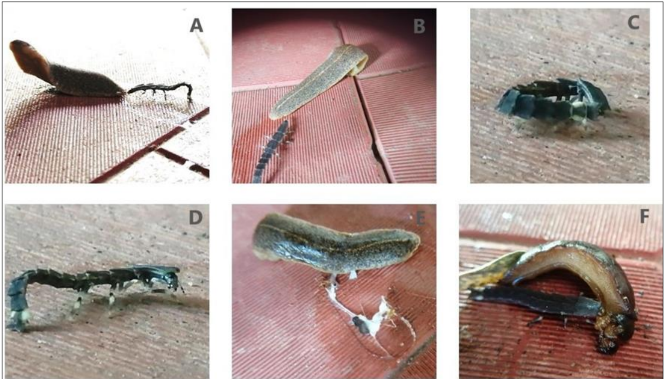
Fig 2: [A] Laevicaulis ite raising its anterior end and Lamproyrid larva attacking the slug at the posterior side. [B]. Laevicaulis alte curling its anterior side. [C]. Larva cleans its mouthparts with pygopodium. [D]. Larva cleans its mouthparts using forelegs. [E]. Thick white mucus secreted by the slug as a defense strategy. [F]. Lamproyrid larva feeding on its kill.