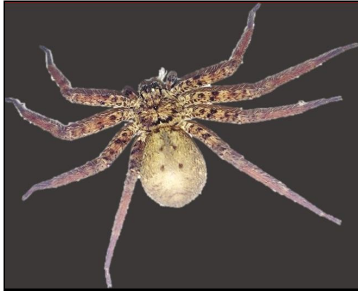
Fig 2: A) Female huntsman spider with four prominent black spots on its enlarged abdomen

and make them free after the examination. To achieve this purpose, we manually performed these experiments with certain modifications to the original experiments presented in earlier reports. To conduct these experiments and to generate the data, the spider was kept in a petri dish separately. This Petri dish was kept below the microscope under high resolution. The images were captured and preserved for the record. The morphometric characters are the body characters, including length, weight, height, etc. These characters of spiders were measured subsequently. The weighing balance was used to measure the weight, and the spider's weight was calculated. After wearing gloves, with a gentle touch, the spider was captured and measured its body length. The length of the male and female bodies was measured separately. The scale was used to measure the morphometric difference between the two sexes. To know the exact difference between males and females, the abdomen of both sexes was measured independently.