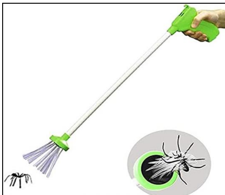
Fig 1: A) Spider catcher to capture the speedy huntsman spider

The spiders were collected manually from the houses of humans and nearby societies of Kandi, Sangareddy district of Hyderabad, Telangana state. The Kandi area is a village of 1790 hectares, and the nearest town is sangareddy which is 8 KM apart. The Kandi location has a latitude of 17° 36' N and a longitude of 78° 05' E. The male and female were captured from nearby human dwelling areas. The spiders were caught with the help of jars and strip of paper. First, trap the spider, and put a pot covering the surrounding areas. Care has been taken that it should not hamper or damage a spider's body parts or appendages. Later on, the piece of paper was inserted inside the jar, and it was made sure that the spider jumped over the jar. In the next step, the paper and the pot were tilted, and the spider was pushed inside the jar. This was a simple but efficient method to collect the spider without any damage or harm to the spider's body. Another technique also used to catch the spider was using a spider catcher; this is another method as well efficient and easy to capture the spider. The huntsman spider is enormous; necessary precautions must be taken before its capture. The male and female huntsman spiders were collected and kept in a separate jars. After its collection, the spider was subjected to identification and confirmation under a fluorescence microscope.