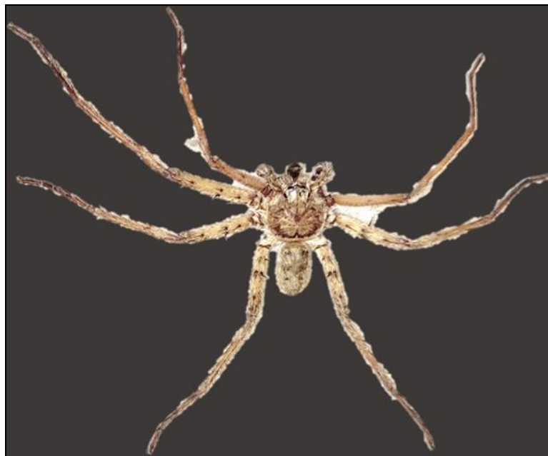
Fig 4: A) Male huntsman spider with sharp and hairy enlarged joined legs and small abdomen