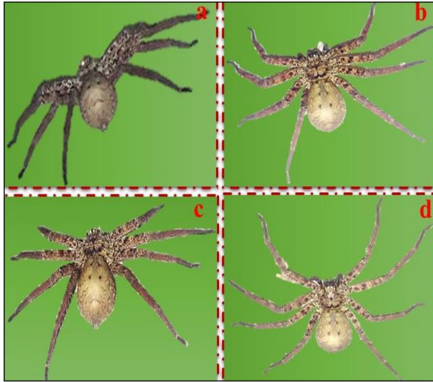
Fig 3: A) (a-d) Female huntsman spider with enlarged abdomen