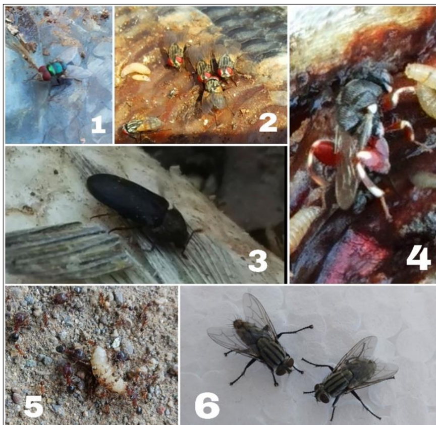
Fig 1: Some important species (1) Chrysomya megacephala (2) Musca domestica (3) Scleron sp. (4) Brachymeria podagrica (5) Pheidole sp. (6) Sarcophaga bullata