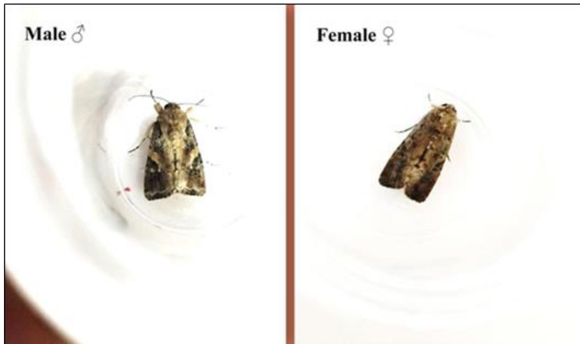
Fig 4: Male and female adult of S. frugiperda emerged from cohort laboratory rearing.

Means ±SE sharing the same small letters in the same columns are statistically insignificant ( P > 0.05 ). Numbers in parentheses represent the range.