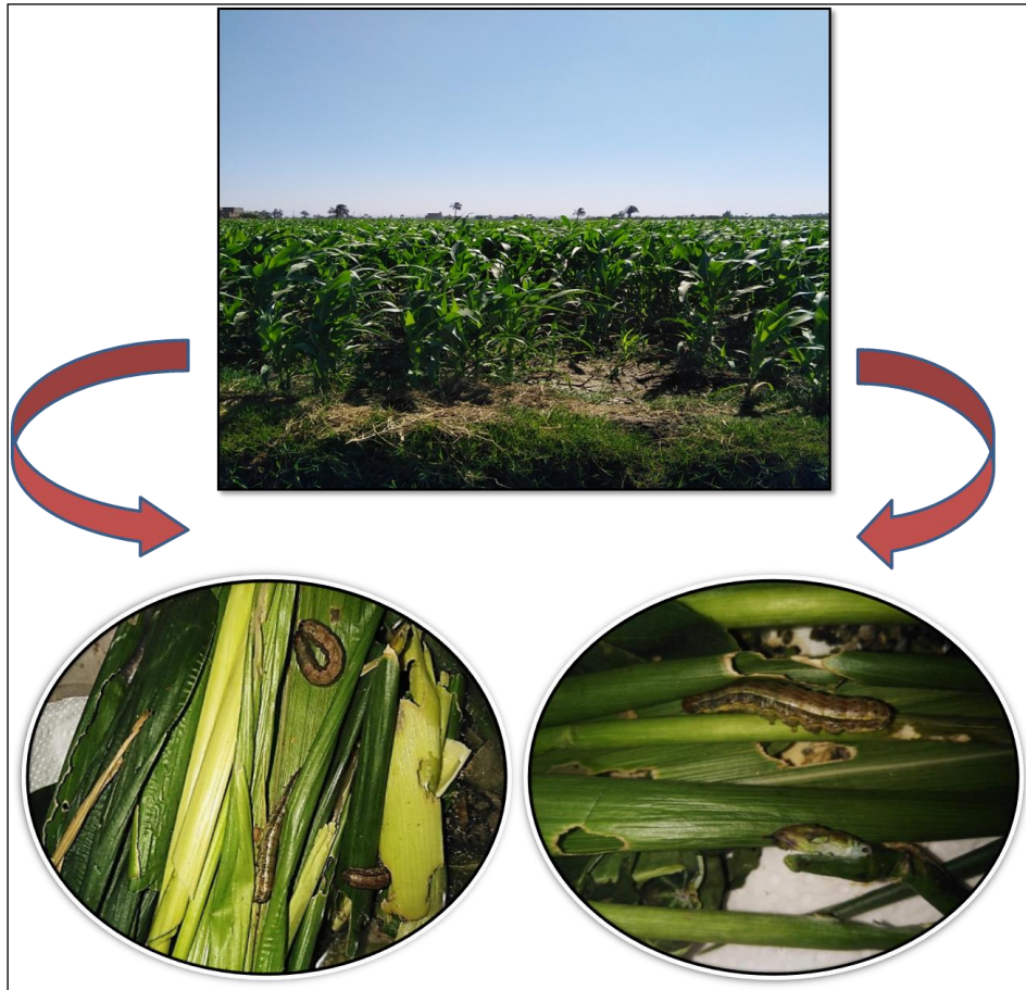
Fig 1: Initial culture of the fall armyworm, S. frugiperda larvae obtained from infested maize fields in Assuit Governorate, Upper Egypt.

Larvae of S. frugiperda (F 0 generation) used in the study were initially collected from farmers' infested maize fields (Fig 1) in Assuit Governorate, Upper Egypt. Plant whorls with damage symptoms were removed from the field and in suitable bags transferred to Assiut insect rearing laboratory, Plant Protection Research Institute, Agricultural Research Center (ARC), for inspection and identification. Different instars of collected larvae were divided in clean plastic container (25 cm diameter x 15 cm height) and reared on fresh maize leaves (natural preferable host), until pupation. Pupae were collected and placed on wooden cages (35 × 35 × 35 cm 3 ) until adult moth emergence. Moths were fed by 10% honey solution soaked on cotton pads, hanged inside the cage and renewed daily till all adult died. The inner walls of the cage were covered with zigzag-sheets of (A 4 ) white copy paper and branches of oleander ( Nerium oleander L.) as ovipositional site, and inspected daily. Neonate larvae (F 1 ) were reared on fresh castor oil leaves ( Ricinus communis L.) until pupation. Then, they were transferred to new cages for adult emergency and egg-laying. The FAW was reared under laboratory conditions (27 ± 1 °C; > 60% RH and 12L: 12D) for using in the experiments.