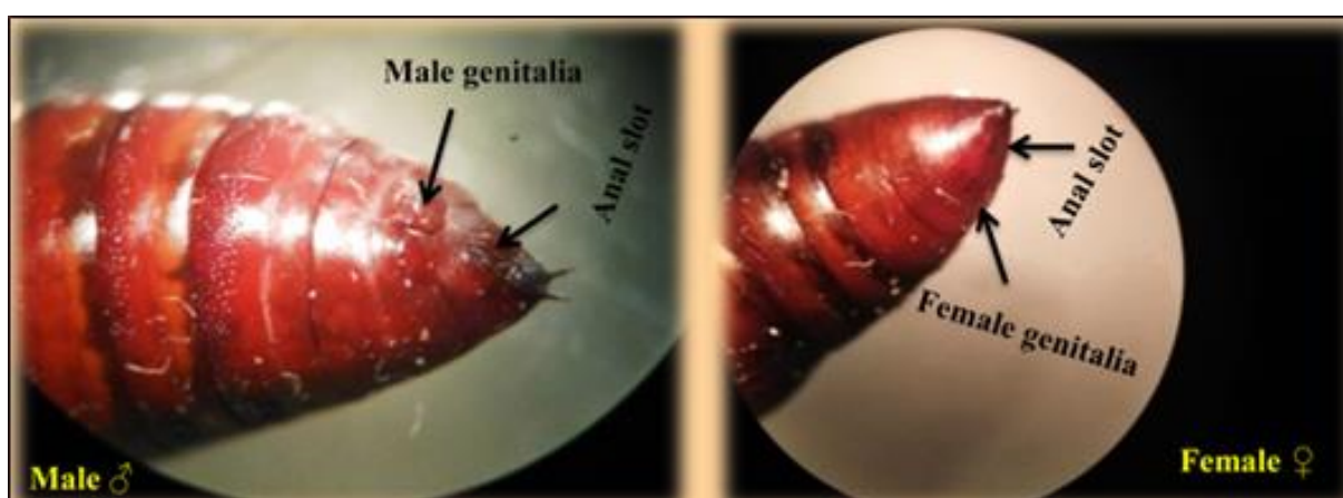
Fig 3: Male and female pupae of S. frugiperda distinguished by the genital opening and anal slot distance.