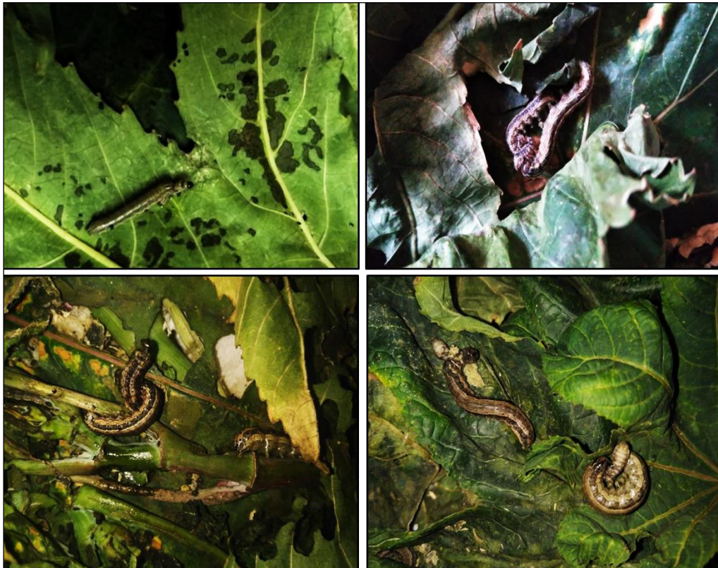
Fig 2: Cannibalistic behavior of S. frugiperda larvae fed on castor oil leaves, R. communis under cohort laboratory rearing.