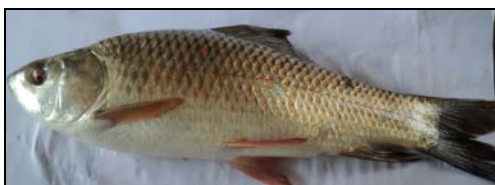
Fig 1: ( Labeo rohita )

The fresh water Rohu ( Labeo rohita Ham.) were collected from Saliyamangalam, Thanjavur District, Tamil Nadu, India.