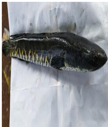
Fig 5: Channa punctatus

In present investigation graph shows that Prevalence and density of cestode parasites during oct 2019 to nov.2020. The maximum prevalence of cestode parasites observed in summer month (March2020 to May 2020). In March to may 2020 maximum cestode parasites were collected from freshwater fishes mentioned in table. From above table and graph shows that considerable difference in prevalence of fish cestode parasites among different month of year. The highest cestode prevalence 84.61% followed by 79.16% and 78.26% recorded during month of summer.