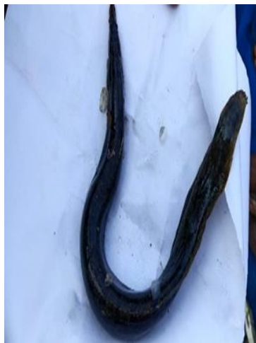
Fig 4: Mastacembalus armatus