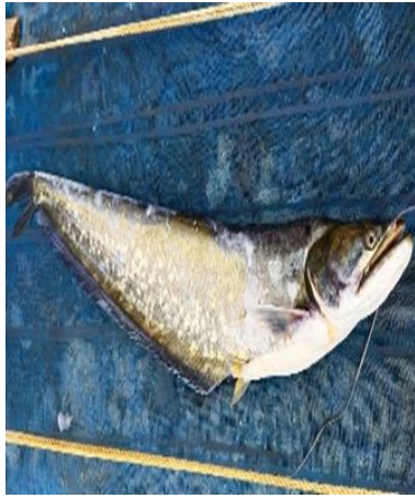
Fig 3: Wallago attu