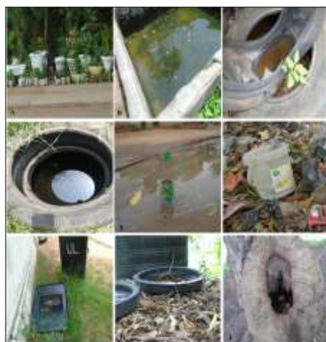
Fig 3: Types of breeding sites identified: A flower pots, B water-closet pit, C and D used tires; E used cans, F plastic pot on a garbage dump, G trash can lid, H abandoned poly-tank lids, I natural tree-hole.