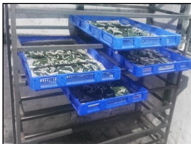
Plate 1: Mulberry Silk Worm (4 th Instar)

Pest: Pest is an organism which detrimental the crops, livestock etc. The most of the pest are insects, some are plants and very few are fungi. Pests are cause the stunt growth of their hosts and damage the survival of hosts. Some common pests are ants, snail, slugs, caterpillars, spiders, mites, whiteflies, fungus, gnats, aphids etc.