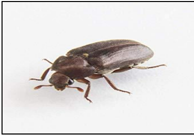
Plate 5: Dermestid beetle ( Dermestes ater )

These are the group of coleopterous insects which mainly damage stored cocoons. Most of the damages is done by the larvae when cocoons are stifled and stored for a long time. The females lay about 150-250 eggs in the floss of the cocoons, the larvae bore through the cocoons and eat the pupae of silkworms.