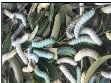
Plate 2: Eri silk worm (4 th Instar)