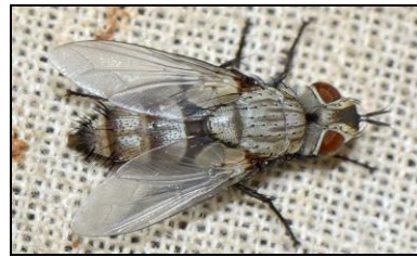
Plate 3: Uzi fly ( Exorista bombycis )

mature at pupae stage with completely damaging of silk moths. Ozi fly is black and grey stripes and dark ebony color.