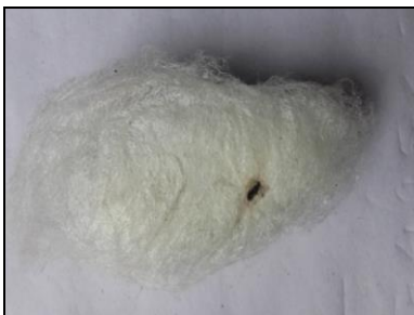
Plate 6: Hole exited from Eri silk cocoons