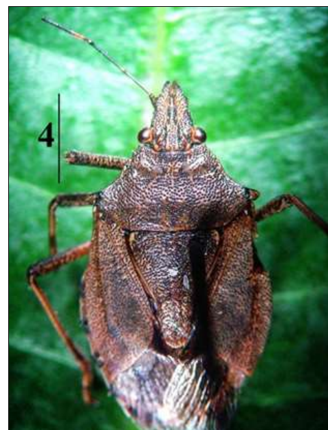
Fig 1: Bolaca unicolor Walker, dorsal habitus

Distribution: India: Assam, Meghalaya, Nagaland, newly recorded for West Bengal; Bhutan, China, Pakistan, Vietnam (Distant, 1902; Aukema & Reiger, 2006; Nizamani et al. , 2019) [17, 5, 33].