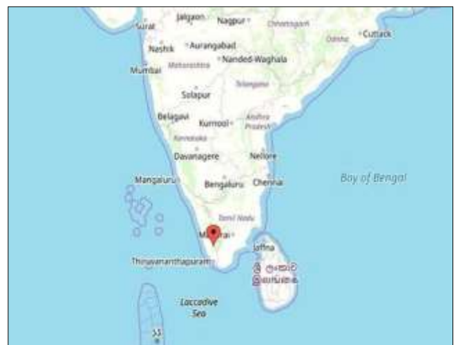
Map 1: Distribution map- Cheruthoni. Idukki

Abbreviations: CL-Cephalothorax length, CW- Cephalothorax width, AL-Abdomen length, AW- Abdomen width, TL-Total length, AME- anterior median eyes, ALE- anterior lateral eyes, PME- posterior median eyes, Fig-Figure, N-North, E-East, mm-millimeters, MOQ-Median Ocular Quadrate, Ant.W- Anterior width, Post. W- Posterior width.