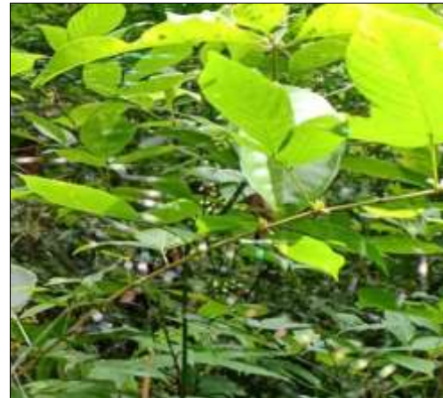
Fig 1: Habitat of Nasoona crucifera (Cheruthoni, Idukki)

Specimen was collected by hand collection method from Cheruthoni, Idukki district. Identification was done in the laboratory by referring Tanasevitch (2018) [4] and Malamel (2018) [10] . The specimen was preserved in 70% ethyl alcohol. Microphotographs were taken by Olympus digital camera attached to an Olympus Magnus Stereozoom Microscope as described by Sekhar Reshmi and Jose K Sunil (2019) [11] . The measurement and illustration of the specimen was done using drawing tube. Leg and pedipalp measurements were taken from the dorsal side of the body and are given in the order: Total, Femur, Patella, Tibia, Metatarsus (except palp) and Tarsus. The eye measurements were taken with calibrated ocular micrometer. Female epigyne was cleared insitu with clove oil. The description was done by immersing the spider in a petri dish containing 70% ethyl alcohol. All measurements are in millimeters. Map was prepared using online tool available at www.mapcustomizer.com.