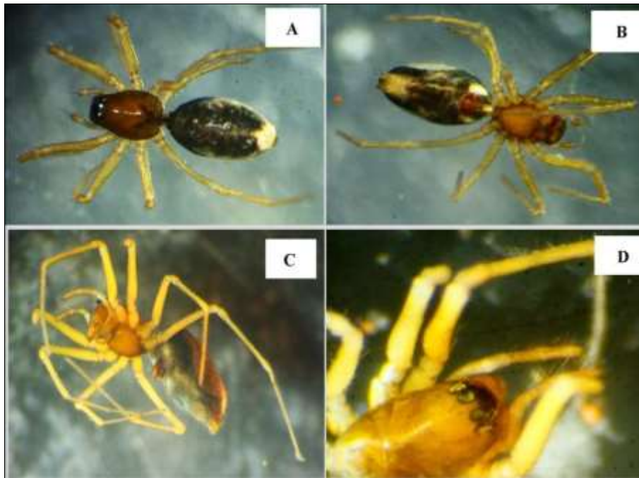
Fig 2: Nasoona crucifera female. (A) Dorsal view (B) Ventral view (C) Ventro- lateral view with Sternum (D) Eyes

3.10 Habitat: Collected from the leaf of a shrub. (Fig.1)