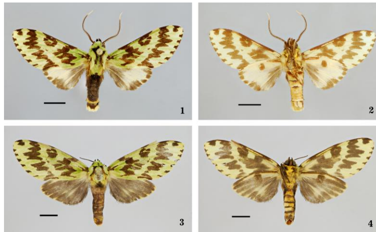
Fig 1–4. Symplebia pipkinsorum Grados, sp. nov. 1. Holotype male, dorsal. 2. Holotype male, ventral. 3. Paratype female, dorsal (Refugio Amazonas lodge). 4. Paratype female, ventral (Refugio Amazonas Lodge). Scales=5 mm.

Geographic distribution: In the departments of Loreto, Pasco, Huánuco, Cusco, Madre de Dios and Puno.