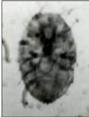
Fig 1: Microphotograph of the first larva (crawler) of Aonidiella orientalis (Newstead).